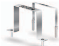
Open Air Shunt Resistors